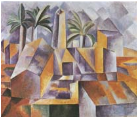
(Plate 1) Pablo Picasso, Factory, 1909